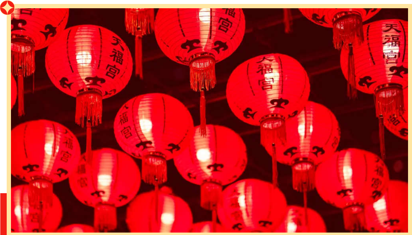
2021 Shanghai New Year Gala for Foreign Experts